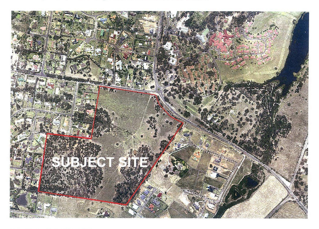
Figure 1 – Location Map

This planning proposal refers to the land identified as Lot 201 in DP 734620 (refer to Figure 1 ). The subject site has a dual frontage to Smalls Road to the North and Werombi Road to the North East. The subject site is irregular in shape with a total area of 27.21ha. The subject site is gently undulating with part of the site grading from the northern part of the site at the high point near the round-about intersection of Werombi Road and Smalls Road, south-west toward the existing natural watercourse traversing the centre of the site in an east-west direction. A small part of northern portion of the site grades towards Werombi Road.